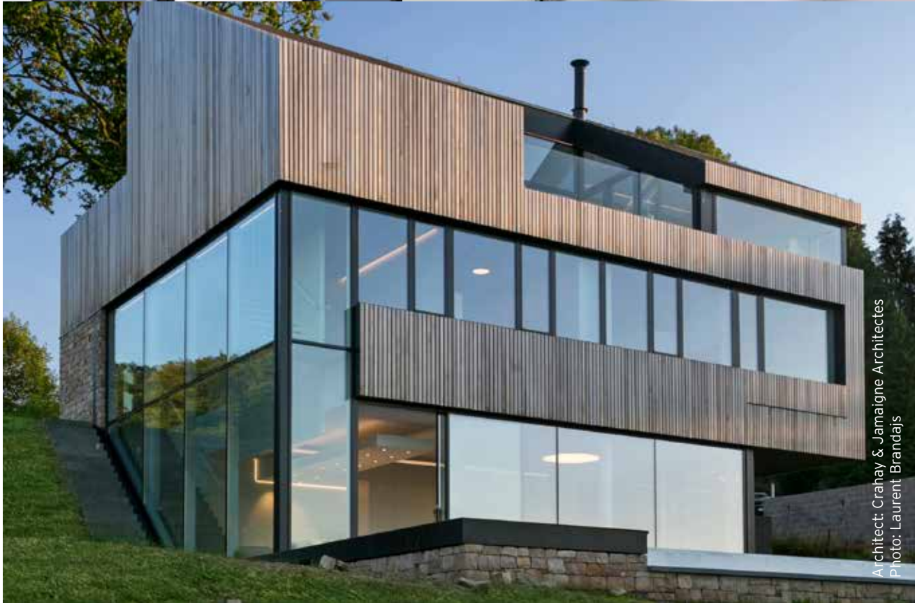
Architect: Crahay & Jamaigne Architectes