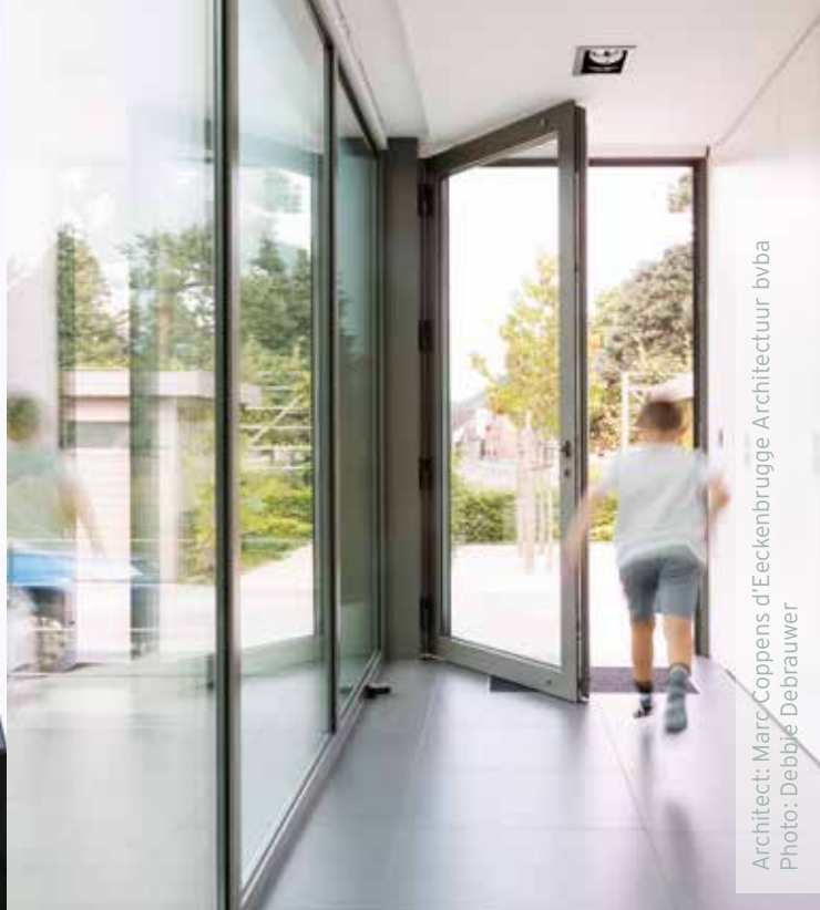
Architect: Marc Coppens d'Eeckenbrugge Architectuur bvba